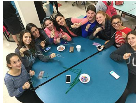
Making sukkah decorations at Mishmar