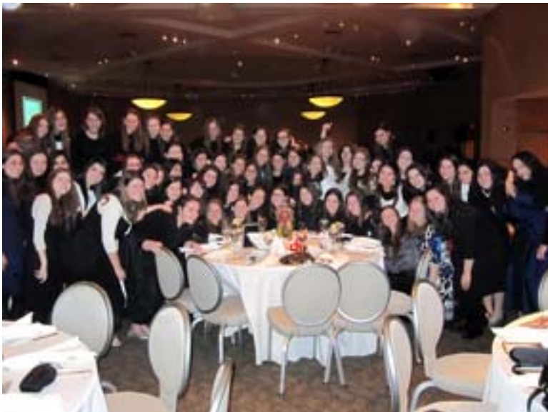
at left, members of the Class of 2011 and some recent alumnae