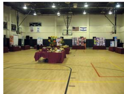
The Academic and Student Life Fair, before the start of the program