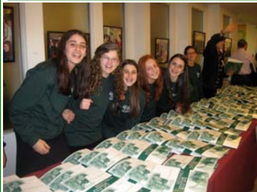
Student Ambassadors ready to greet prospective families

If you were in or around Ma'ayanot on the evening of November 9, you might have asked, "Why is this night different from other weekday nights?" No, you would not have been jumping ahead to Pesach but, rather, remarking that while our school is often open in the evening for sports events, meetings, presentations and performances, this week saw our first weekday evening Open House for prospective students. This year's Open House was originally scheduled for the morning of Sunday, October 30, but the change was necessitated by the brief but dramatic and dangerous snowstorm which took place on the previous Shabbat afternoon.