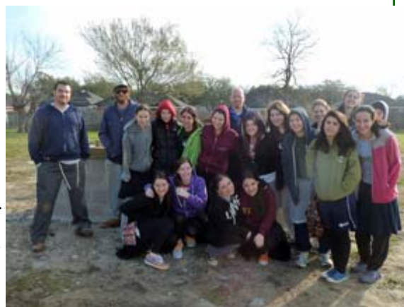
The NCSY Mission to new Orleans