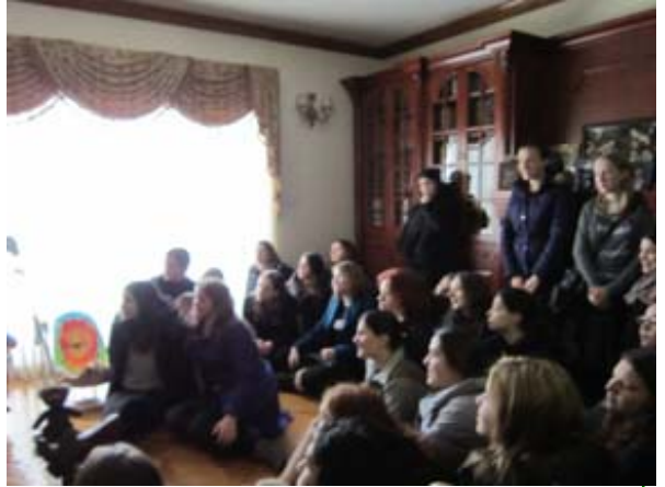
our students listen carefully

which provides dresses for poor brides. At the gemach , our students had an opportunity to learn about the mission and work of this program. Afterwards, Ma'ayanoters had got to speak with women and girls in